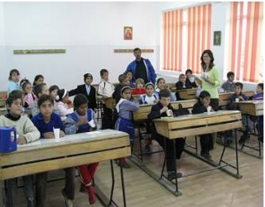
Hot Muesli to warm the stomach and help the children to study better

We were delighted to have the Eurovangelism's, Vision Trip Team spend the better part of the week in our area. We are always moved that people come 1/3 of the way around the globe to encourage us and experience first hand the needs and to see what the Lord is doing about it. Thank you team for all the new Crocs (shoes) knitted items and so much more that you brought as part of your luggage.