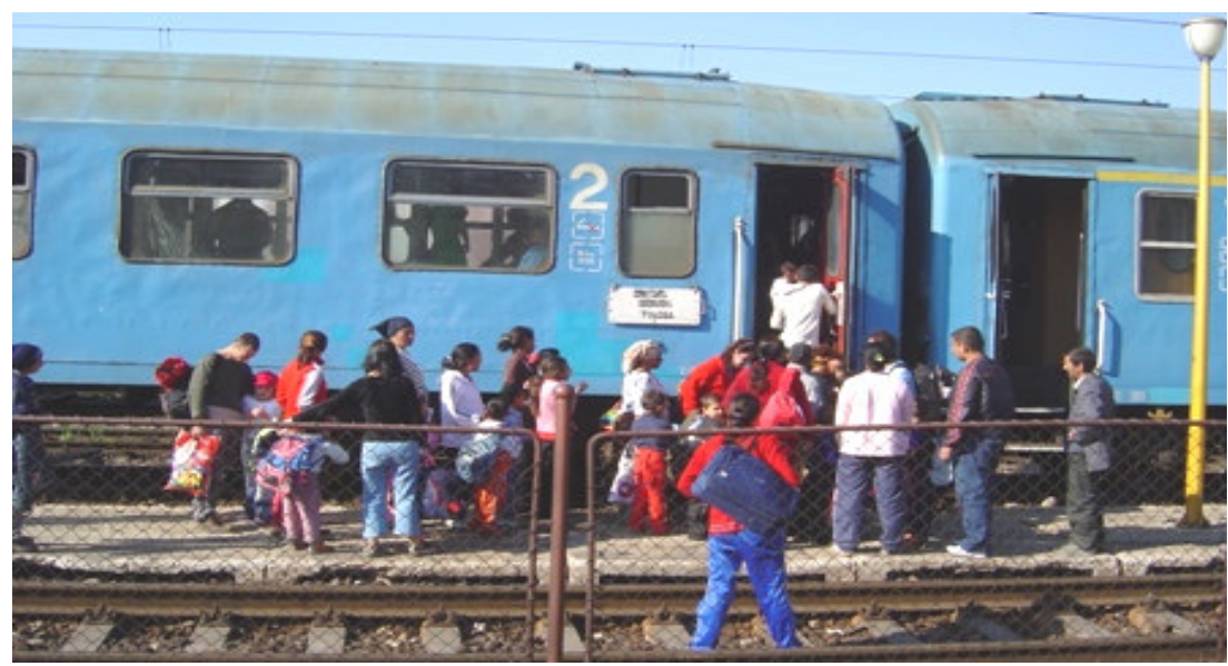
Getting children on the train, headed for camp, how exciting!