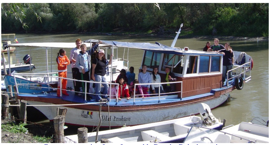
Campers preparing for unforgettable Danube Delta boat trip

Summer camps; have already started, with more to come. We continue to desperately need volunteers for the summer programs. Please make this a matter of serious prayer, as well as looking to the Lord about a personal commitment to come and work with us. Camps cost us a minimum of $50.00 a week per child, and we are sending at least 75 children this summer, with the possibility of another 50 as space becomes available. One village school is asking us to help with their summer educational program. This means feeding 58 children, twice a day, beside materials and personal. We have received a donation of twenty barrels of dehydrated food from Ontario Christian Gleaners, but need a way to get it here. Can you help?