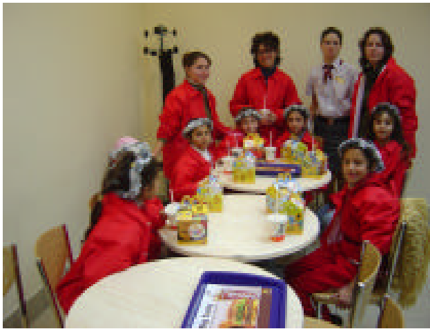
All the children got complementary MacDonald's Happy meals, balloons and more