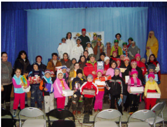
Village children with shoe box gifts