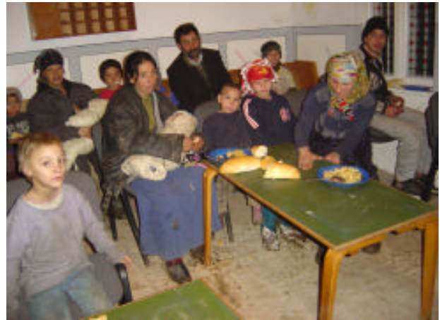
Meal for Mamut bay families