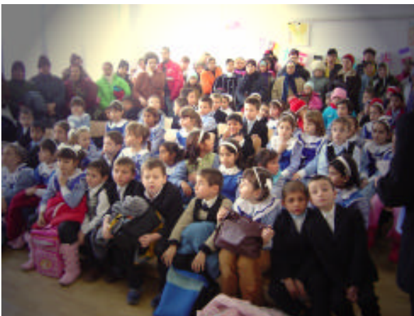
School children with parents and relatives hearing about the birth, life and purpose Jesus life.