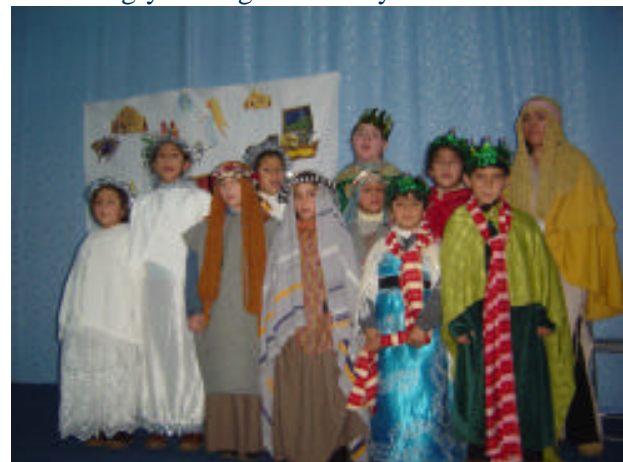
Children's chorus bringing hope and joy at programs, the hospital and other public places.