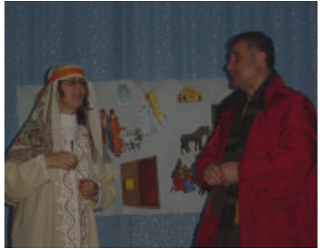
Beti on stage with the Mayor of Medgidia