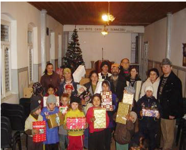
Shoe box gifts, clothing and food in Jesus name