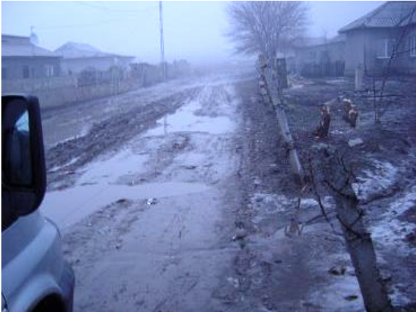
The street to Mamut Bay, the worst is still ahead