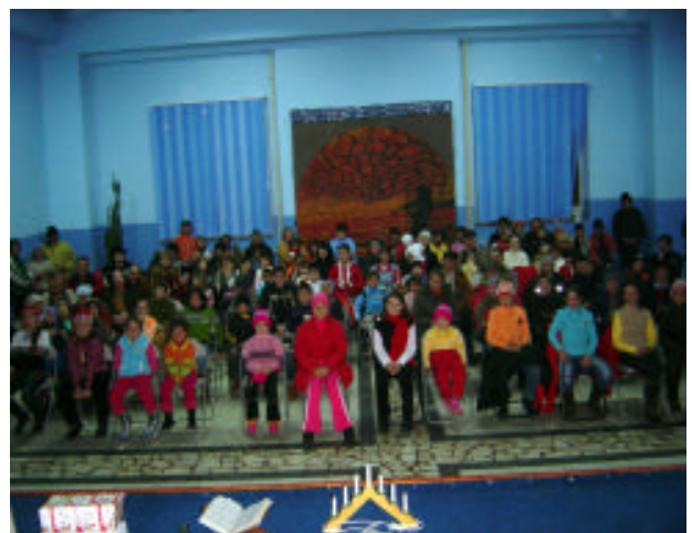
One of the fifteen audiences who heard about Jesus