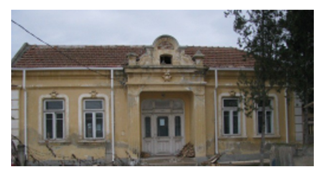
Coming to Canada to see you!

Please make this a matter of special prayer. Perhaps you are skilled in renovations and would consider coming here to give us a hand. Do you have or know of resources that would help make this project a reality?