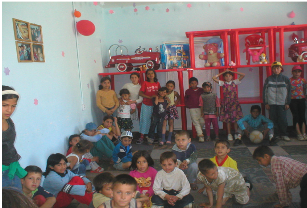
Play time at Lumina Children's Club

Before returning home these children are given a sandwich, pizza or a combination of foods for lunch. In some cases this is the most food a child will have all weekend.