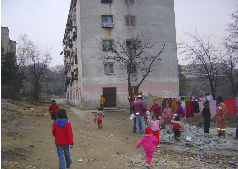
During renovation children helping carry out trash

Presently we are renovating four rooms on the ground floor which will become a clinic, counseling room, daily children's alphabetization class room as well as a personal hygiene room where we will wash and cloth children and treat head lice and fleas.