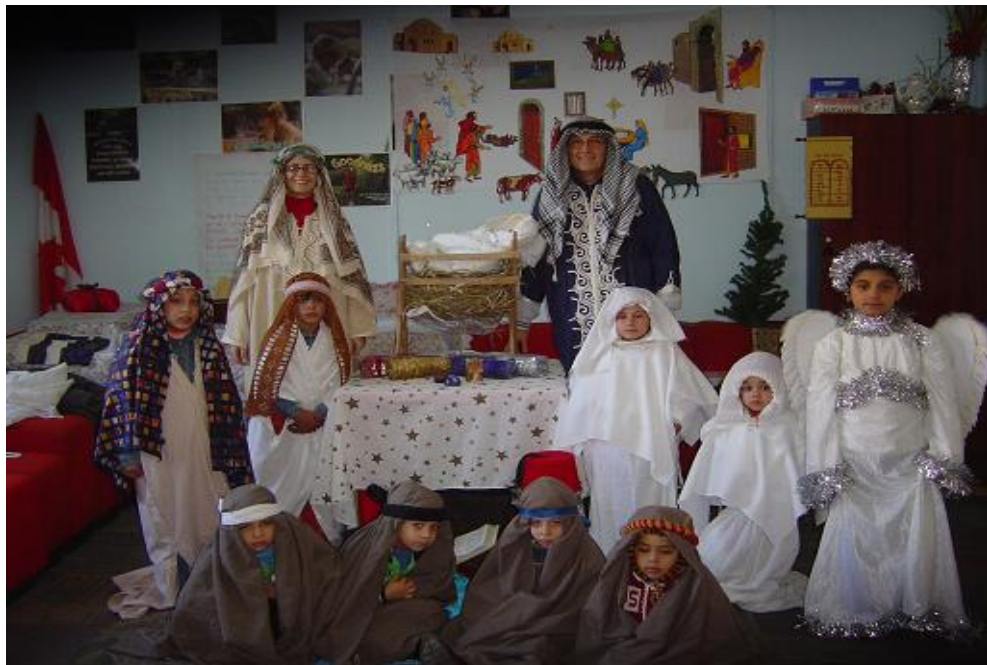
Cast for one of the thirty Christmas 06 programs where close to three thousand hear about the birth, life and resurrection of Jesus Christ.