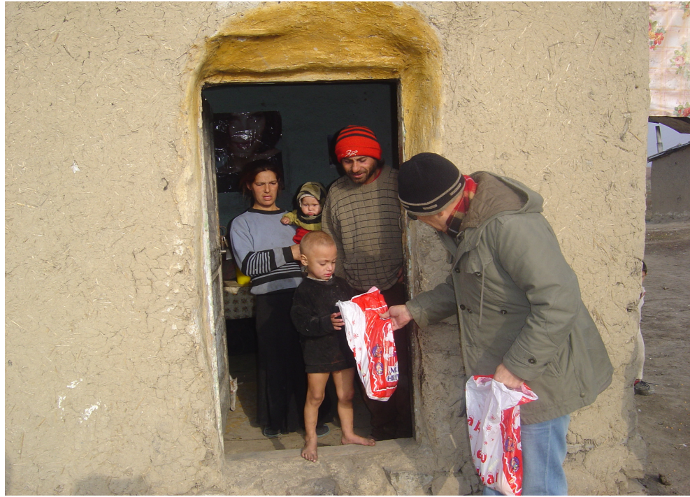
Delivering packets to children