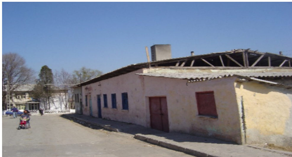
Ali Baba, Hope For The Children Center

Ali Baba; is the predominantly Muslim area of the city. We have just purchase this building which needs major renovation and expansion to become an educational and social aid center. This building is strategically located between a large elementary school and a kindergarten. Here we will teach, feed, wash, tutor, and prepare children and young people for a balanced life in a Christian environment. We will also move the clothing ministry here from a borrowed location. Funds are urgently needed to move ahead with renovations and expansion, as well as ongoing operations.