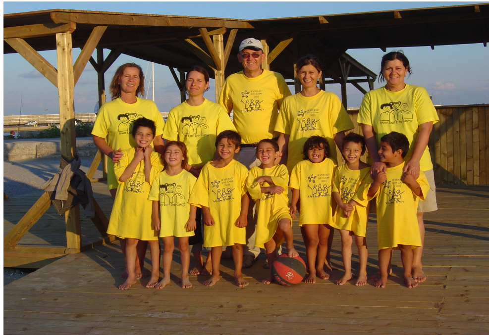
Summer School beach trip