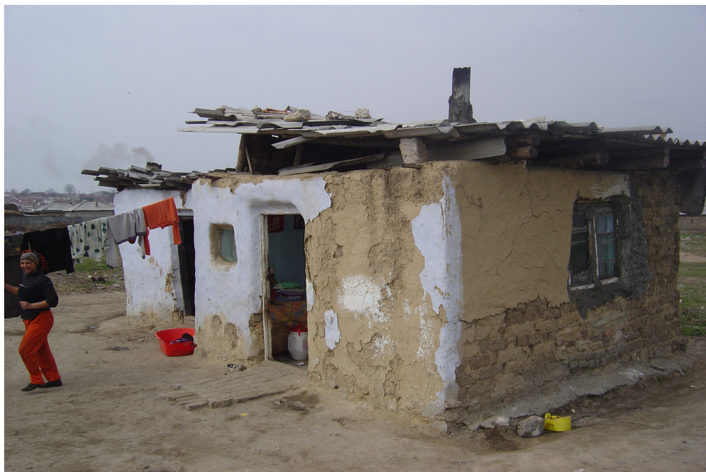
Mud block home, no utilities or comforts

To date we continue to bring food, clothing and medicine to alleviate the suffering. We are working with these and other families to get identity cards and birth certificate. A building has been purchase in this general area where we can bring these children and have daily feeding programs, medical attention and a place for bathing as well as to prepare them for public school.