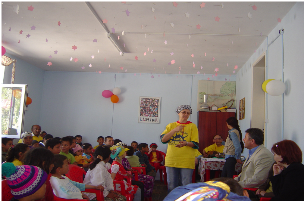
Mayor of Medgidia visiting Lumia program

Casa Alba (White House Apartment out reach); this once horrible block made of 95, 8ft. X 12ft. rooms, houses about 450 souls mostly Muslims. Some of these rooms have up to ten souls calling it home. This place is everything you do not think of when “White House” comes to your mind. There have been great changes in this block where to this day police and mail delivery personal fear to come alone. We have two rooms on the top floor where children and adults have learned to read and write. Regular programs are held here along with worship services. Many children along with numerous adults have accepted Jesus as their personal Savior.