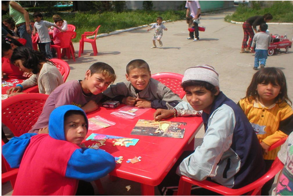
Out door Lumina on a sunny day