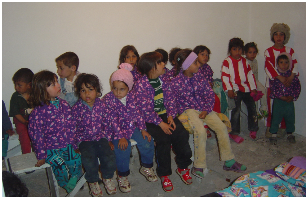
Children in Casa Alba with new clothes they just received

There are many other ministry opportunities that we have had opened to us, from those is city administration to the very lowliest who subsist on the on what they can find in garbage dumpsters. God has given us favor with people in high places who do what they can to help us move forward with our projects.