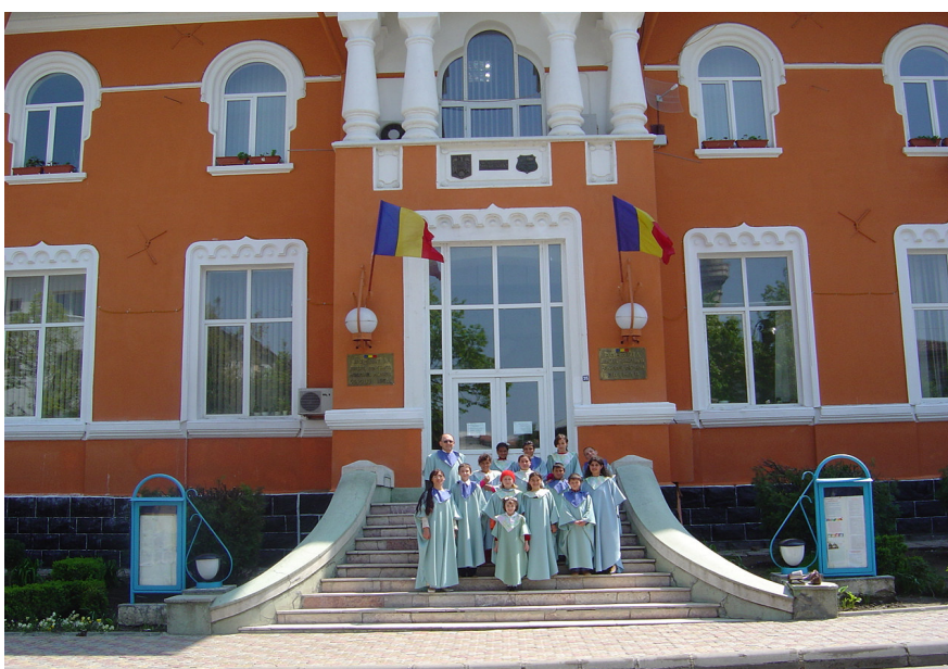
Our children's choir in front of city hall

During the Communist administration, Medgidia had numerous factories, wineries, and communal farms that provided employment to all who were able to work. With the termination of communism came the collapse of the many non-profitable enterprises, leaving a large percentage of this community's labor force without work and income. The average income in Romania is $50.00 per month, making it the lowest income in any Eastern European country.