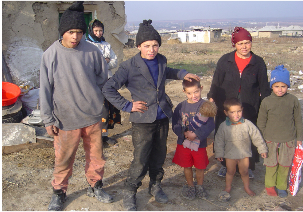
Barefooted child on frozen ground

Ali Baba; is the predominantly Muslim area of the city. We have just purchase this building which needs major renovation and expansion to become an educational and social aid center. This building is strategically located between a large elementary school and a kindergarten. Here we will teach, feed, wash, tutor, and prepare children and young people for a balanced life in a Christian environment. We will also move the clothing ministry here from a borrowed location. Funds are urgently needed to move ahead with renovations and expansion, as well as ongoing operations.