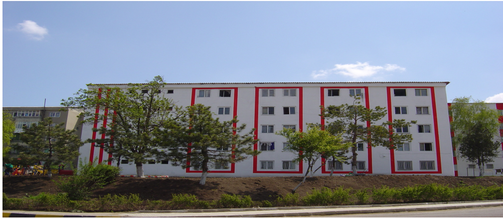
Casa Alba as it appears today; We have the two room top center and four rooms on ground floor far right.

Mamut Bei: the ten most destitute families in Medgidia who have literally made their shacks for the dirt that their houses are built on. Without identity such as marriage and birth certificates these squatters are unable to get any social assistance of any kind and are stuck in the mire at the bottom of the social ladder. Their income consists mostly of scavenging garbage for recyclables and food, while they heat their homes by burning plastic bottles and other waste materials.