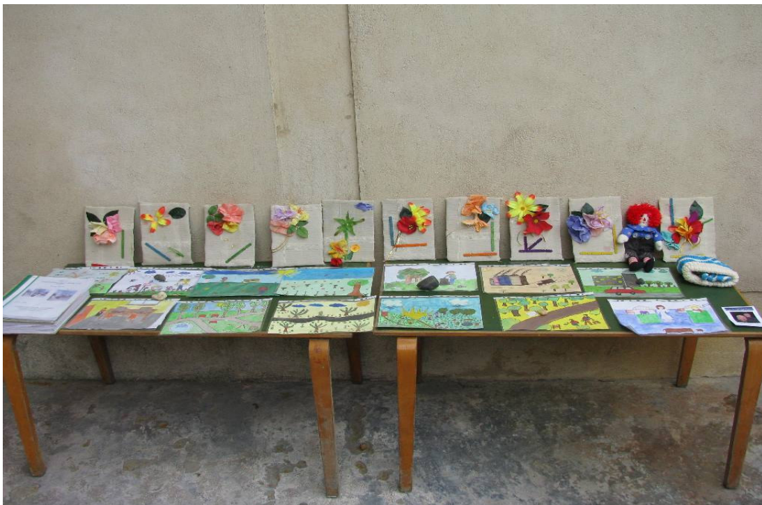
Display of our budding artists creations