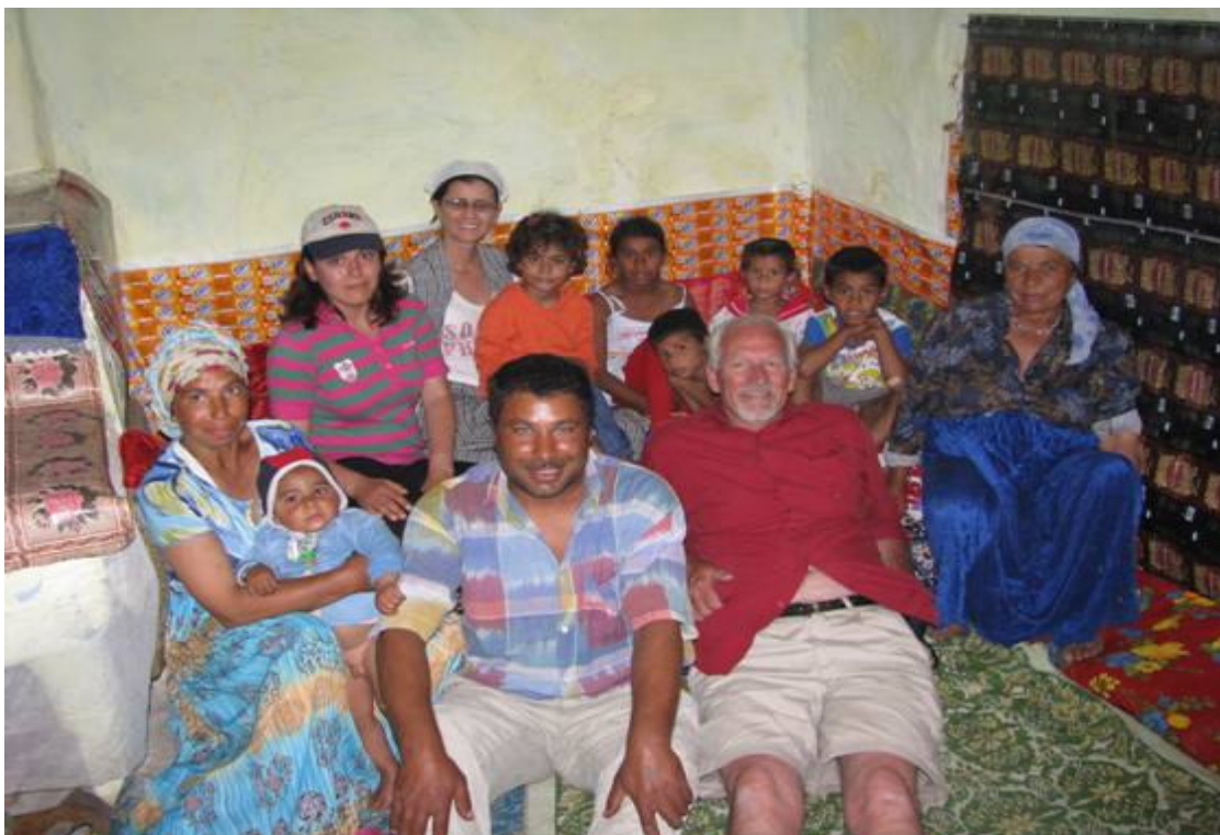
Visiting one of the families we are working with extensively