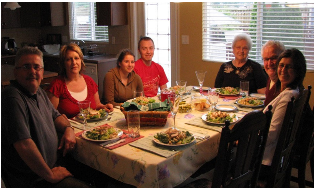
Blessed fellowship with the Suceavas and Stokes

Please consider helping the needy children here in Medgidia as a part of your summer vacation budget. Pray about it and act today.